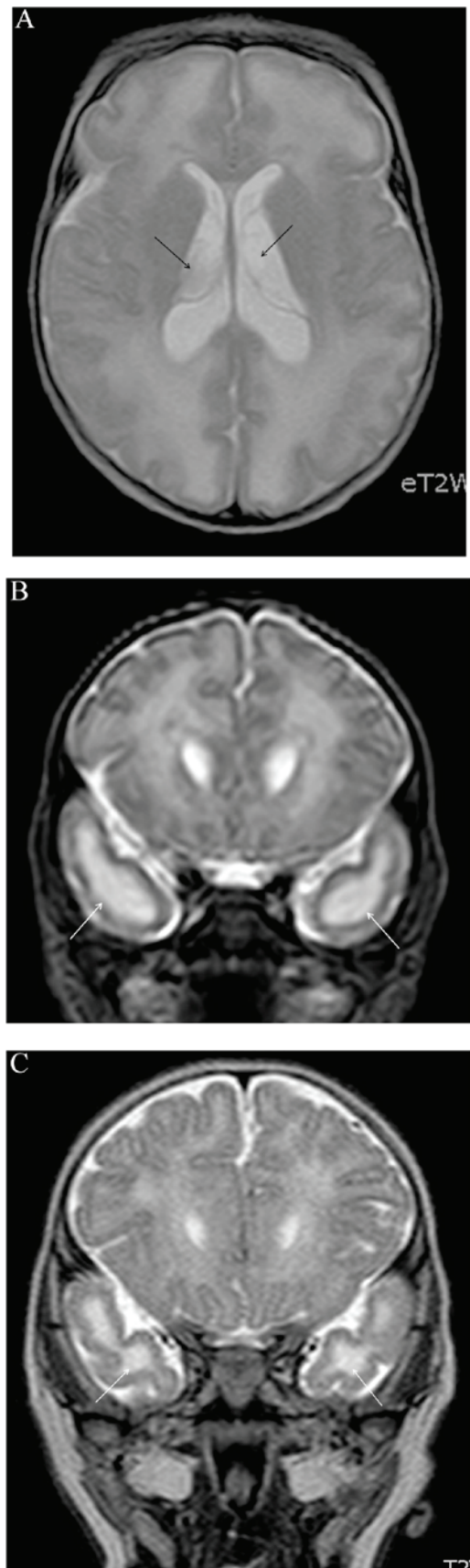
Figure 2. Brain magnetic resonance imaging (MRI) in a neonate with history of third trimester cytomegalovirus (CMV) infection. (A) axial T2-Weighted image through the lateral ventricles - black arrows indicate the presence of intraventricular cysts. (B) Coronal T2-Weighted image reveals signal abnormality in the temporal lobes bilaterally (white arrows). (C) On the 3-month follow-up, same to section b demonstrates persistent signal abnormality in the temporal lobes and additional white matter volume loss (white arrows).